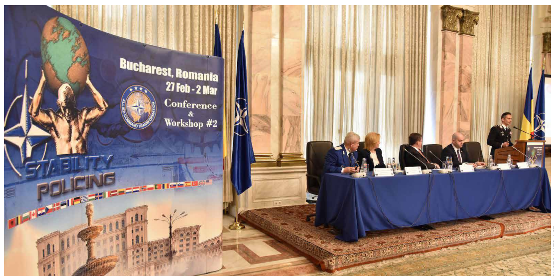
ACT started the NATO Stability Policing Concept Development project to develop a new concept and (finally) endow the Alliance with new (policing) capabilities

successful, most experience gained and research done refers to post-conflict situations. Bridging a possible public security gap and addressing the spoiler threat from criminalised power structures that, according to the studies of Dziedzic, are the predominant cause of failure of peace and stability operations, are major challenges for the international community. 10 It is equally well recognised that bridging the public security gap, addressing crime and criminalised power structures and building indigenous police capacities requires policing capabilities that can be deployed based on a sound concept.