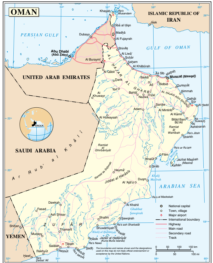
Map No. 3730 Rev. 4 UNITED NATIONS January 2004

A second limitation made the effects of the withdrawal from East of Suez and the simultaneous budget reductions become only more significant. At a time when British military capabilities were steadily reduced,