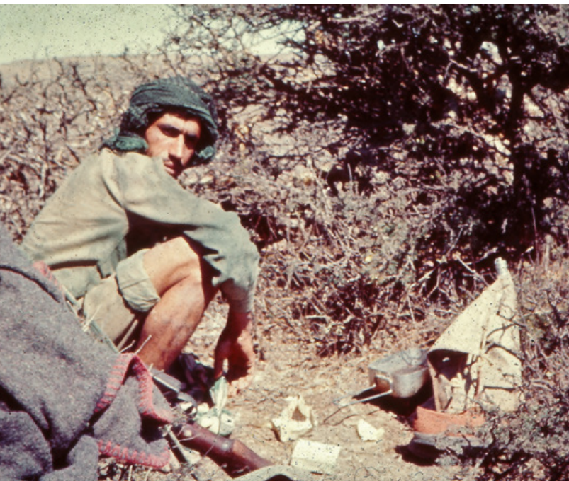
A member of the Sultan's Armed Forces (SAF) in 1970