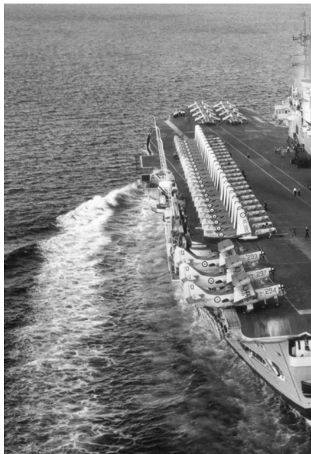
The HMS Ark Royal served partly East of Suez. In the late sixties the British government decided to withdraw from this part of the world. It remained in Oman though, because of its strategical position at the entrance of the Suez Canal

A third limitation of perhaps even greater concern was the invasion of Czechoslovakia by the Warsaw pact, and its partner states' subsequent increase in defence spending in 1968-69. 31 Western analysts perceived the Soviet military modernisation and its development of a conventional doctrine as a serious threat to Western Europe. 32 Therefore, NATO had to keep up a credible force in West Germany in order to deter the Warsaw Pact. 33 As a result, Britain could not withdraw any substantial forces from Germany without endangering the solidarity and effectiveness of the NATO alliance. 34 Addressing primarily other threats and crises British military resources were not available for use in the Dhofar insurgency. 35