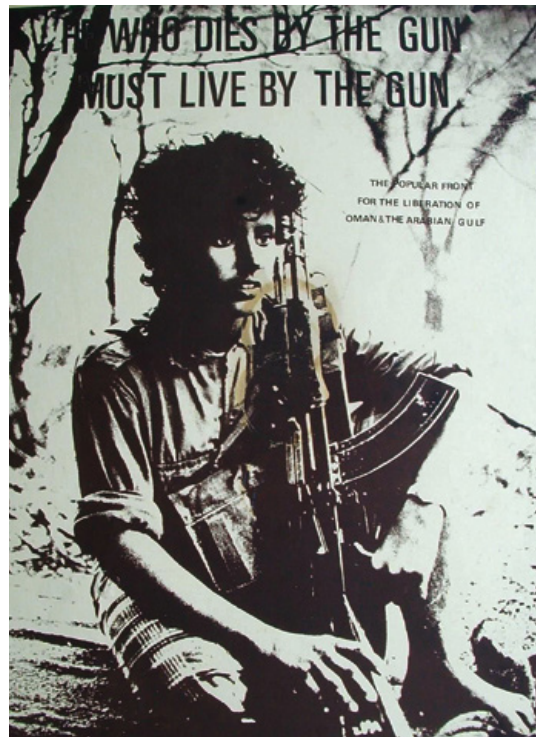
Leaflet spread by the Marxist Popular Front for the Liberation of Oman (PFLOAG) in Dhofar, home of the insurgency against Sultan Said Bin Taimur

creating discontent. 43 The sultan was able to suppress the insurgency for the first few years. 44 The situation changed drastically after the British withdrawal from neighbouring Aden and South Yemen in 1967, which had been British protectorates until then. The British departure enabled the Marxist National Liberation Front (NLF) to seize power and rename the country as the People's Democratic Republic of Yemen (PDRY). 45 Similarity in political convictions of the PDRY and of the Dhofari rebels soon gave rise to material support flowing into Dhofar. 46 Other communist regimes such as China, North Korea, and eventually the Soviet Union, contributed support by providing weapons, training, and sometimes even advisers. 47 Under communist influence, the Dhofari insurgents changed their name into the Popular Front for the Liberation of the Occupied Arab Gulf (PFLOAG). 48 The PFLOAG was divided into two groups, the first consisting of hard-line communists who had been trained abroad and indoctrinated in the communist ideology. 49 The second group was composed of tribesmen who