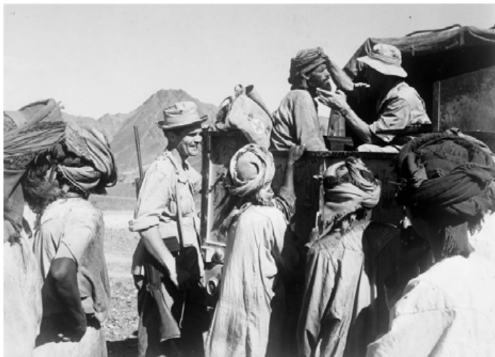
British SAS gives medical treatment in the remote Yanqul Plain of Oman

All in all, the success of the campaign in Dhofar can be attributed to three main factors. The first was the fact that the British and Omani