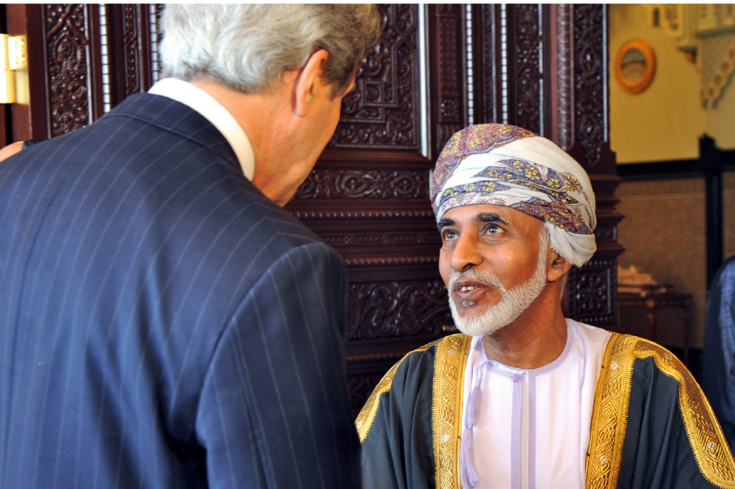
Sultan Qaboos bin al Said rose to power in 1970 after overthrowing his father. He countered the PFLOAG insurgency successfully with foreign aid. Qaboos then modernized Oman. He is the longest serving Arab leader