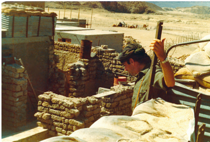
British military inside the BATT-house at Mirbat