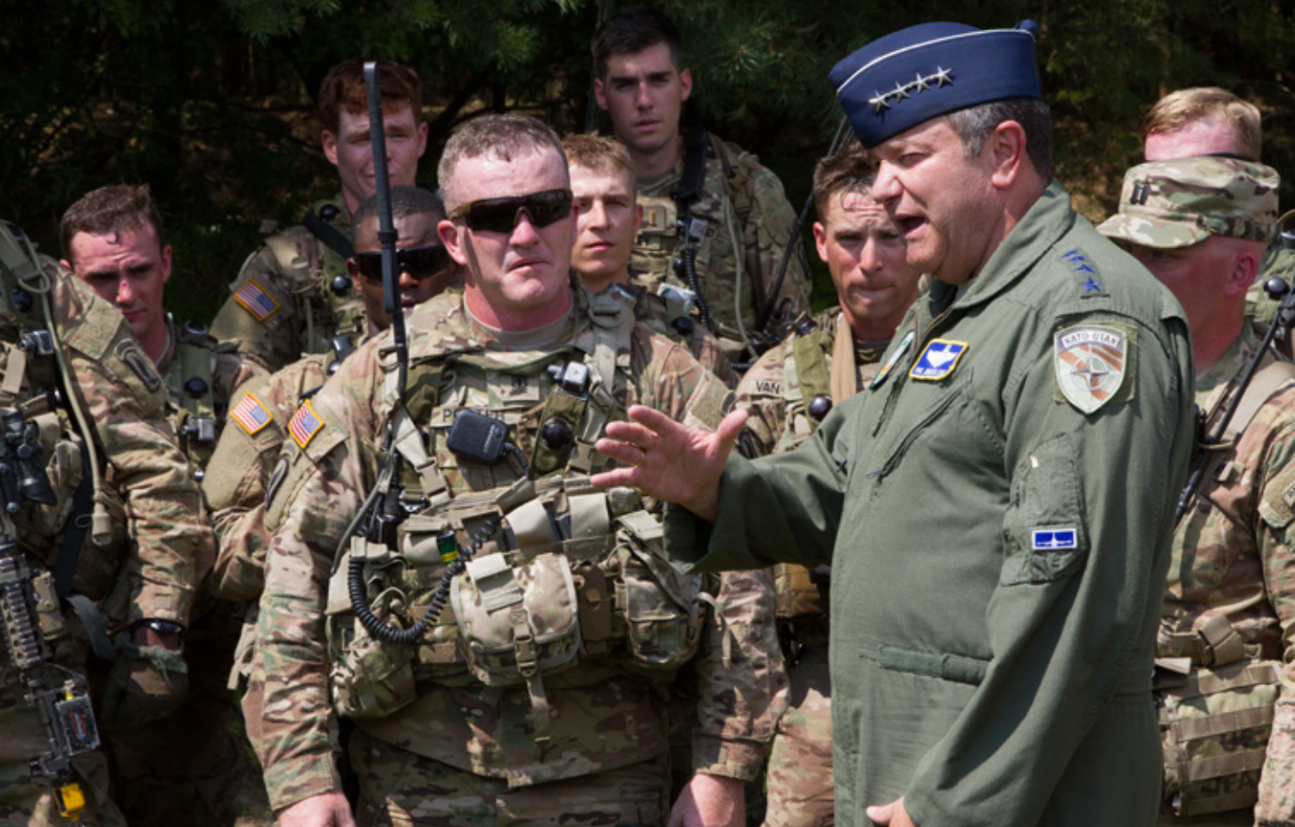
US General Philip Breedlove in Ukraine in 2015. He was NATO's SACEUR at that time and described Russia's annexation of Crimea as a major concern to NATO. Especially the information aspect was impressive, according to Breedlove