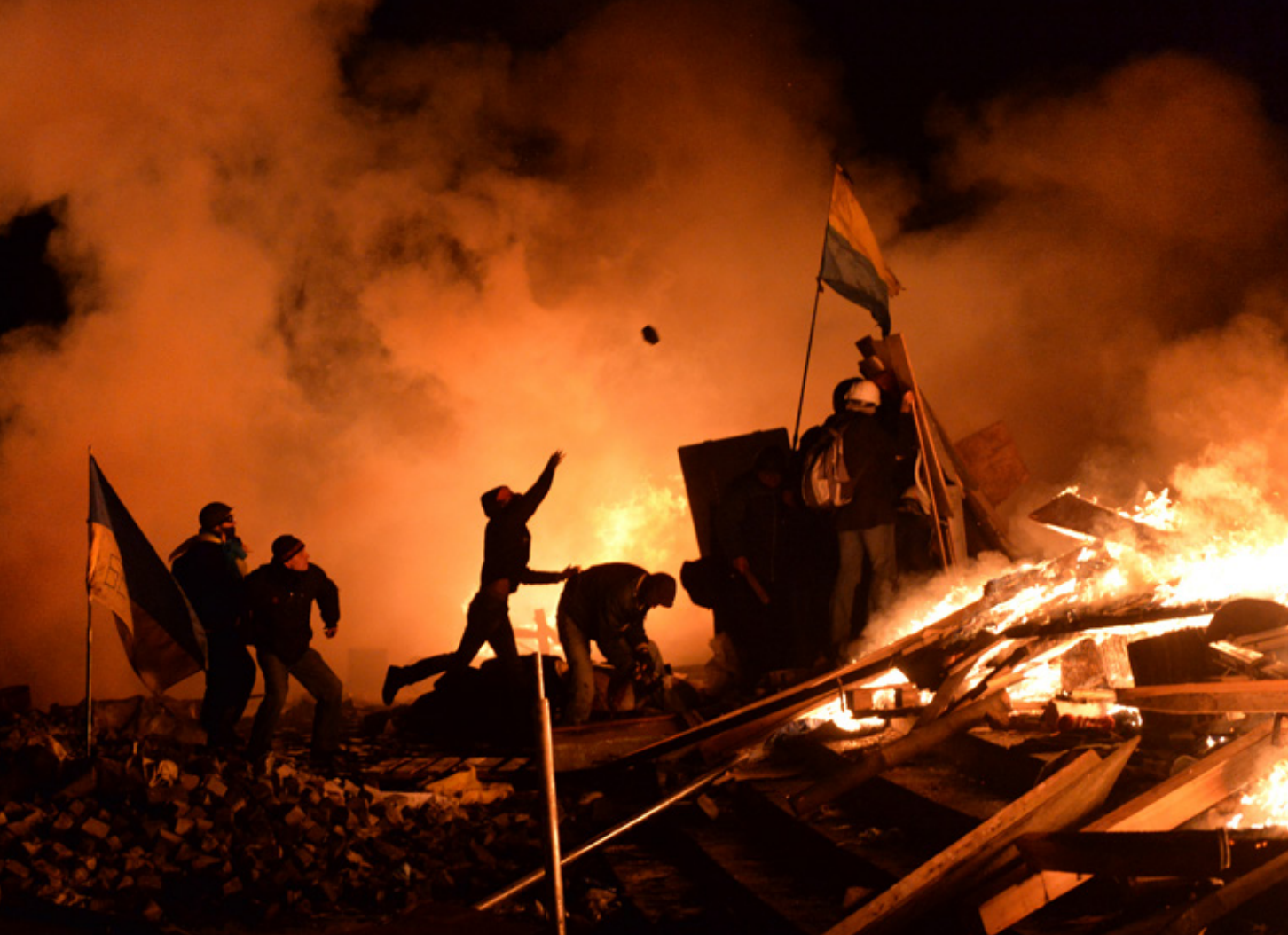
Ukrainian protesters in Maidan Square, Kyiv, 2014