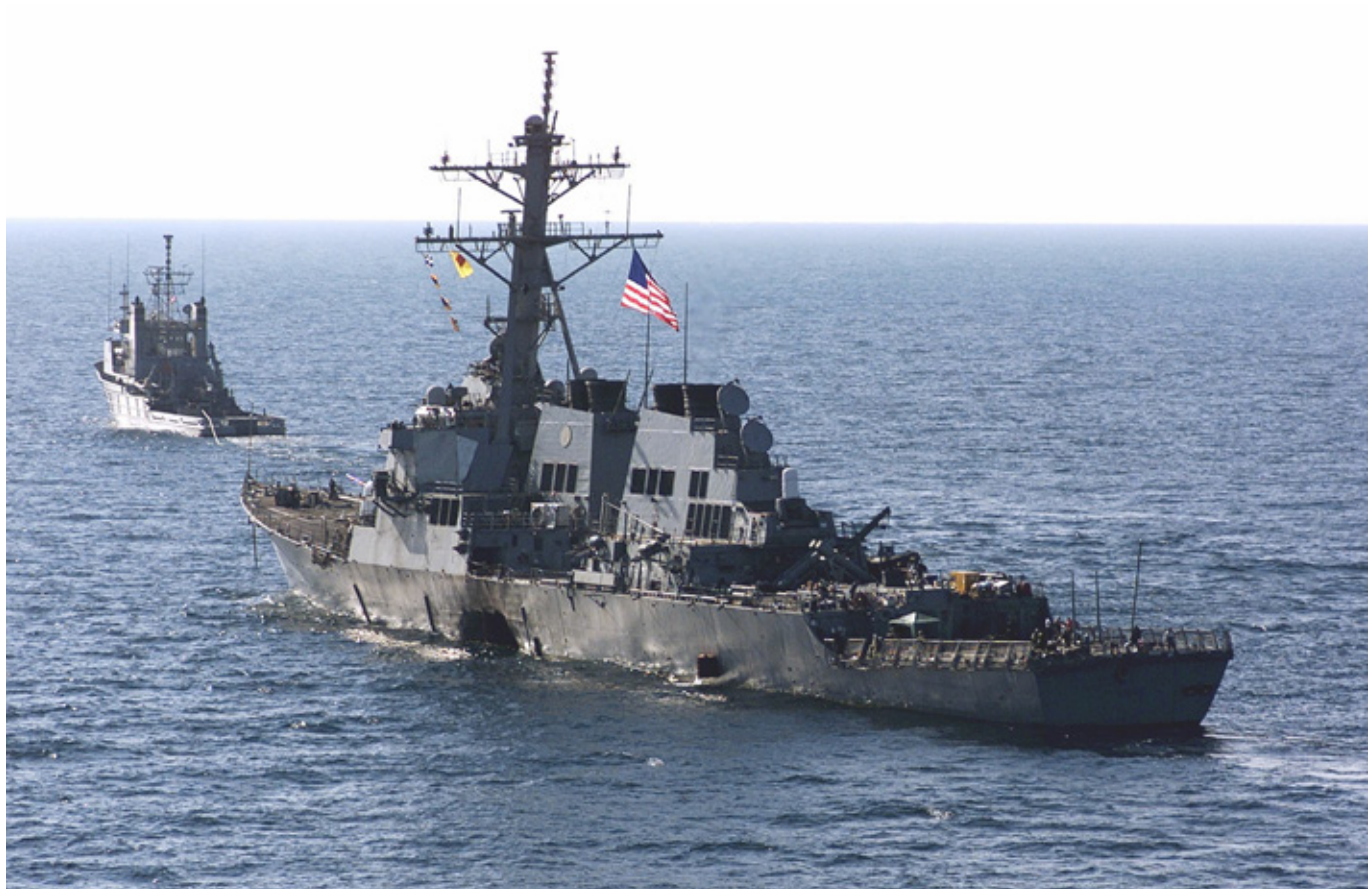
The USS Cole is towed away from Aden into the open sea, after al-Qaida attacked the ship in October 2000