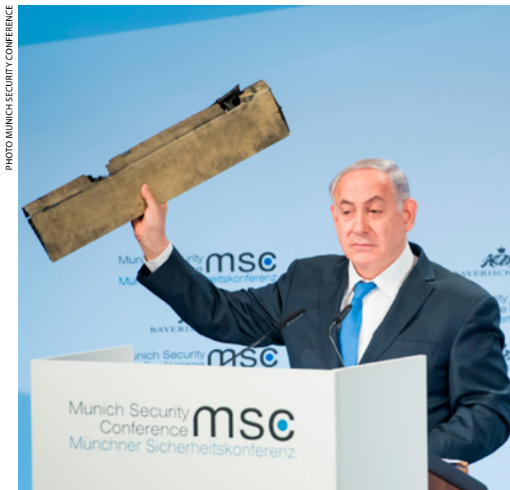
Underlining the Iranian threat, at the Munich Security Conference (2018) Netanyahu held up a fragment of a shot down Iranian drone

The military leadership of the Islamic Revolution Guard Corps (IRGC) used language in line with Khamenei. In November 2017, for example, IRGC-general Qassim Soleimani wrote a public letter to the Supreme Leader on the event of the ‘defeat of ISIS’, when Iranian supported militias drove ISIS from a Syrian-Iraqi border town. Soleimani’s wording partly reflected the Supreme Leader’s use of language (e.g. ‘poison of Zionism’ and ‘dark and dangerous conspiracy’). 13 Khamenei replied with a similar public letter of his own. Another