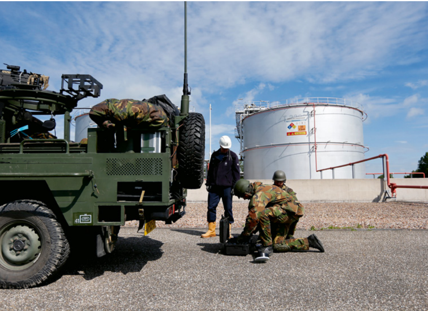
Armed forces have unique core competencies in enhancing security, which is fundamental for economic and social progress