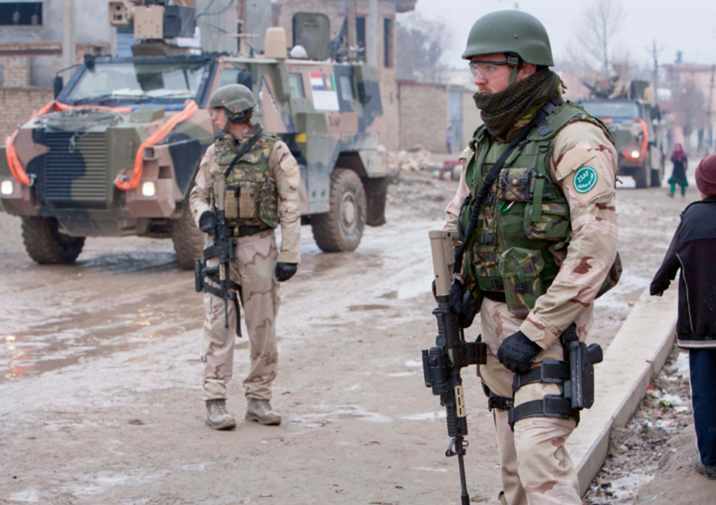
Gathering information during a patrol: Over the next decade, information will become the focal point in the Act stage of the OODA Loop