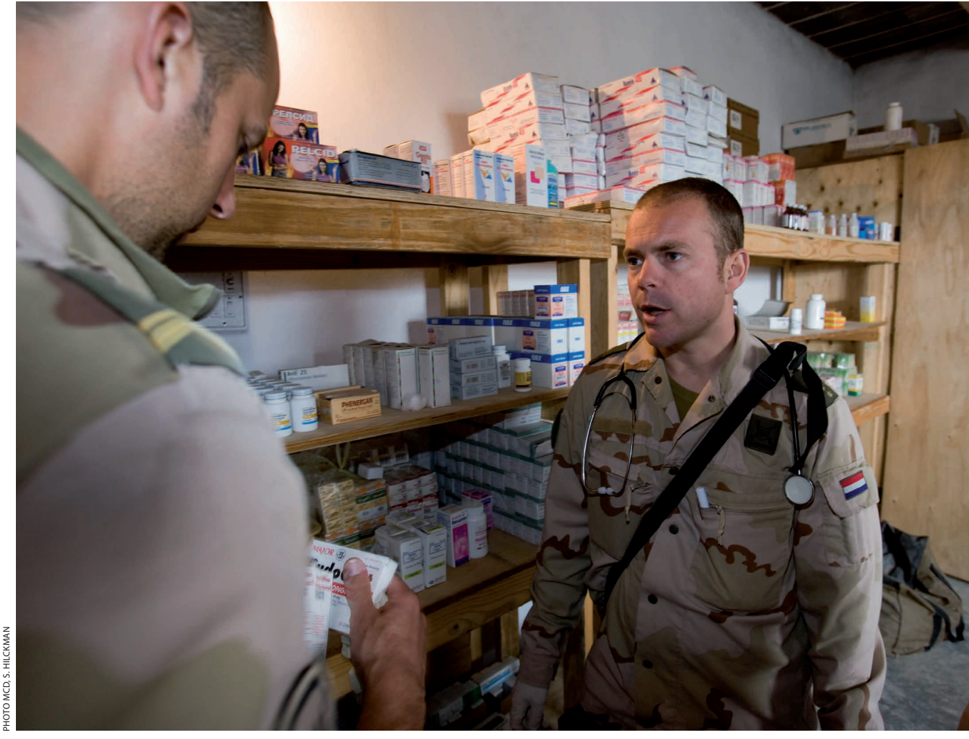
Uruzgan, Deh Rawod, 2007. Local Afghans visit the 'Sick Call'. Twice a week children were examined and provided with medicine, mainly vitamin pills

doctrines and training courses. Knowledge of the management of war-zone injuries is also valuable in treating casualties from natural disasters or (terrorist) mass casualty situations.<sup>20</sup> Studying the changing anatomical distributions of war injuries might help in developing lifesaving materials and better protective equipment. To date, only a few prospective battlefield studies<sup>21</sup> (with a high level of evidence) have been conducted. The PRISMO study<sup>22</sup> is a fine example of Dutch modern research, and might help us to disentangle factors of relevance in Post-Traumatic Stress Disorder. Therefore, in order to collect data and draw meaningful conclusions, also regarding quality of