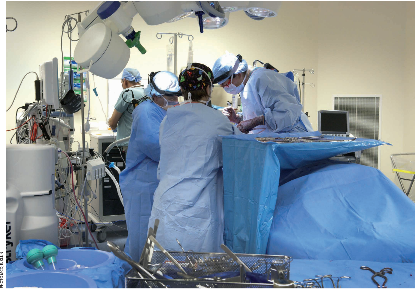
Afghanistan, Kandahar Airfield Role 3 Hospital. Operation room. The predominant mechanisms of injury are still explosions and gunshot wounds

Improvements and modifications in dedicated rotary or fixed wing evacuation, combined with the mentioned current practices, have reduced mortality rates to far below 5 percent. <sup>15</sup> The military surgeon plays a vital role in the initial care of a wounded service member and should be ready for this demanding task in the damage control surgery phase. It is conceivable that a 'young' military surgeon will deploy soon after completing civilian residency training, encountering complex combat injuries he is not familiar with, simply because they are rare in civilian trauma or are taken care of by a different type of (surgical) specialist.