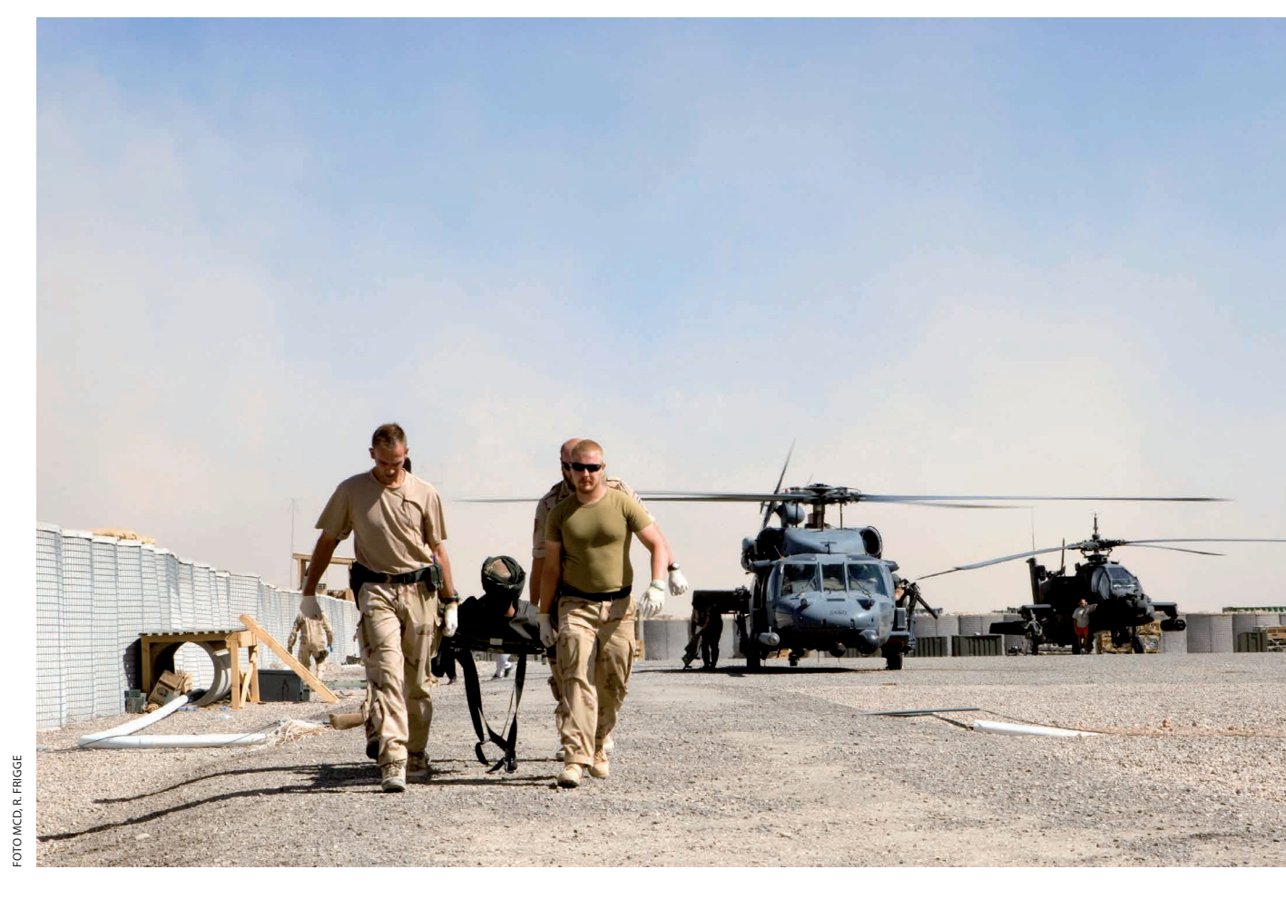
The Netherlands participated in ISAF with Task Force Uruzgan (TFU), and were lead nation in Uruzgan province between 2006 –2010. In the role 2 hospital medics took also care for the Afghans, like members of the Afghan police

risk factors and populations at risk, and in evaluating efficiency of delivered care.<sup>8</sup> However, the development of reliable conclusions and recommendations requires the universal use of clear and unambiguous casualty definitions (see figure 1).