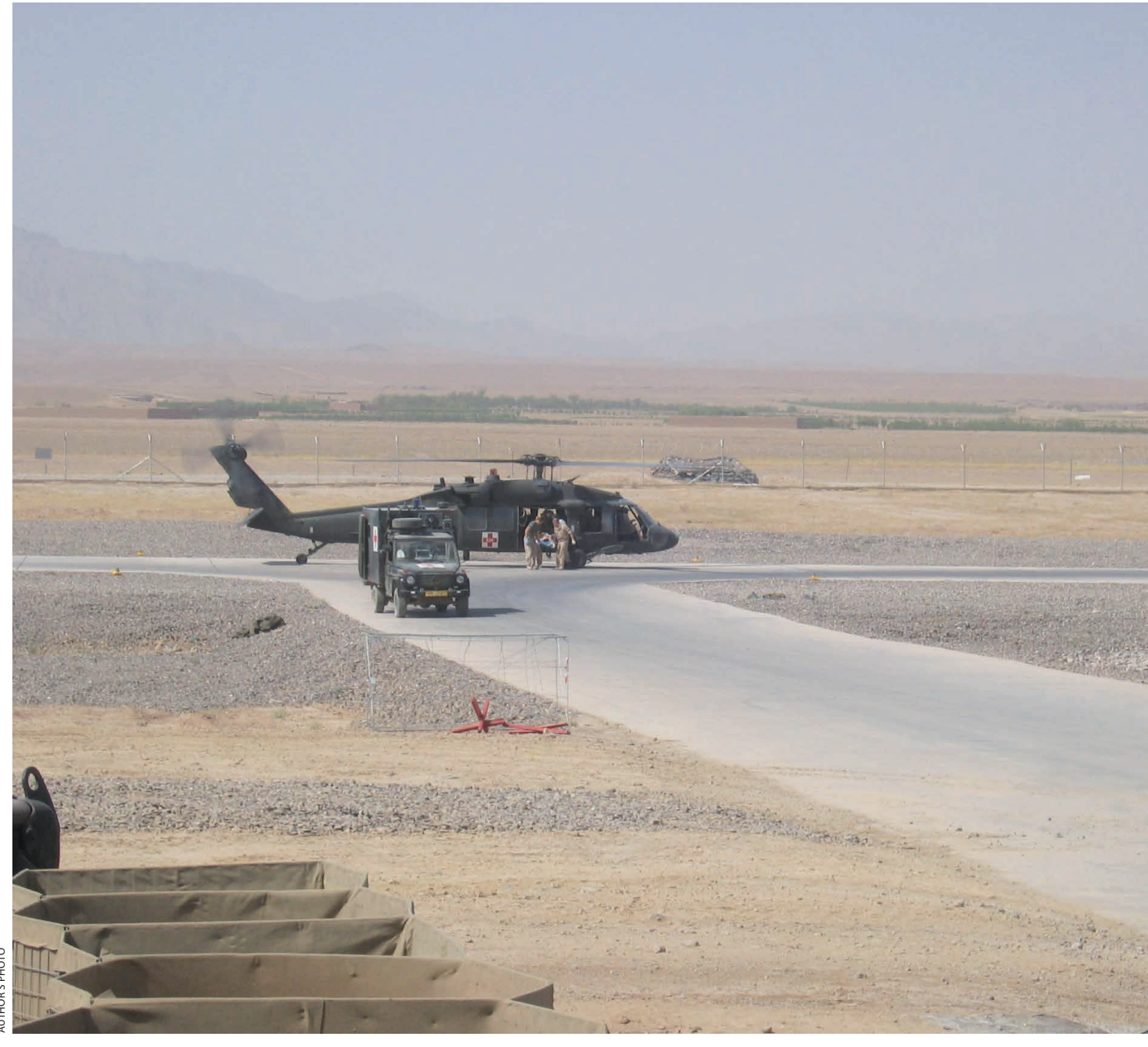
Human 'boots on the ground' will likely remain crucial in future armed conflicts. Therefore, we will have to learn as much as possible from recent experiences in war-zones and introduce these observations in doctrines and training courses

the ongoing 'super' specialization and the loss of the true general surgeon. Not many surgeons will be exposed to, and capable of dealing with, ossal, vascular and truncal injuries. We should anticipate on this development, several possible solutions were discussed in this article. The changes in the way armed conflicts are